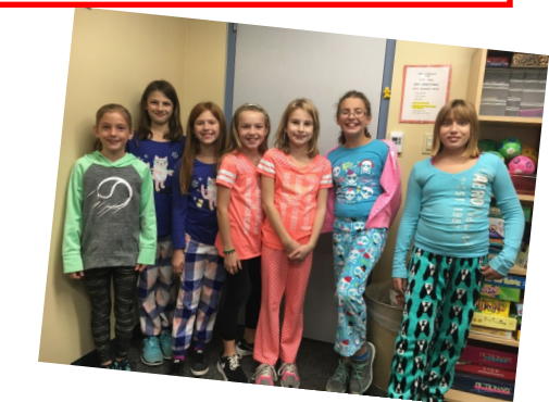
Dreams come true when we are drug free!