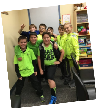
Futures are brighter without drugs!

I pledge to stay in school and learn the things I need to know. I pledge to make the world a better place for kids like me to grow. I pledge to keep my dreams alive and be all that I can be. I pledge to live a healthy life and to keep myself drug free!